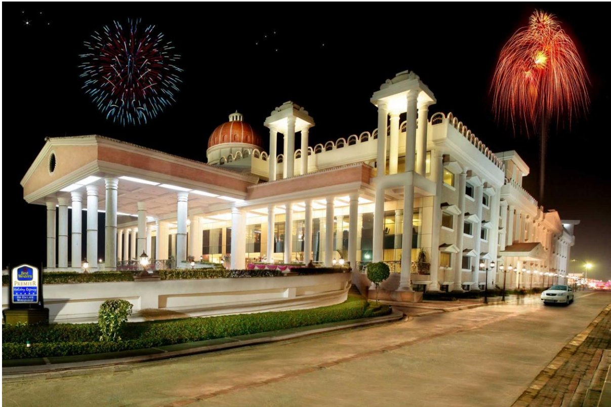
1. Grand Facade: A majestic entrance surrounded by lush gardens.