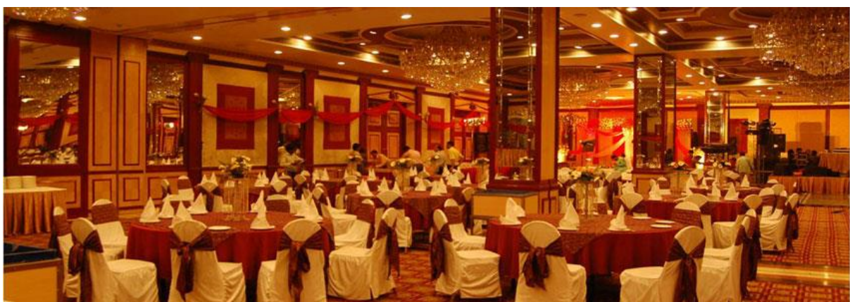
2. Crystal Ballroom: Glittering chandeliers and a spacious setup for grand events.